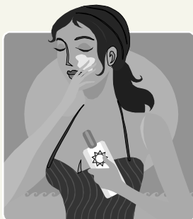
Don't forget your sun block this summer!

Keep reading for details on all of the new summer programs the South branch has to offer this summer. Be sure and sign up fast—you don't want to miss out.